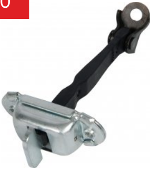
Oe Ref: 68630-0K011 DOOR CHECK STRAP HILUX VII ( 2005 - 2016 ) REAR RIGHT , REAR LEFT