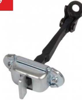
Oe Ref: 68610-0K012 DOOR CHECK STRAP HILUX VII ( 2005 - 2016 ) FRONT RIGHT , FRONT LEFT