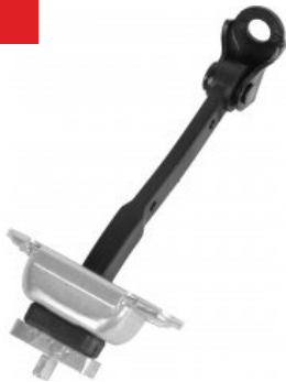
Oe Ref: 68640-52010 DOOR CHECK STRAP YARIS I ( 1999 - 2003 ) REAR RIGHT , REAR LEFT