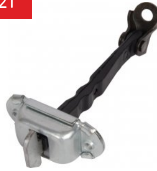
Oe Ref: 68610-0K091 DOOR CHECK STRAP HILUX VIII ( 2016- ) FRONT RIGHT , FRONT LEFT