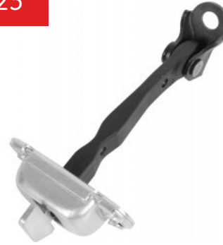
Oe Ref: 68610-52010 DOOR CHECK STRAP YARIS I ( 1999 - 2003 ) FRONT RIGHT , FRONT LEFT