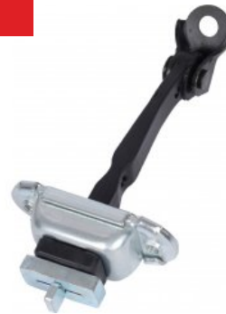
Oe Ref: 68610-0D010 A68610-0D010 DOOR CHECK STRAP YARIS II ( 2003-2005 ) FRONT RIGHT , FRONT LEFT