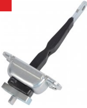
Oe Ref: 68630-35050 DOOR CHECK STRAP HILUX VI ( 1997 - 2004 ) REAR RIGHT , REAR LEFT