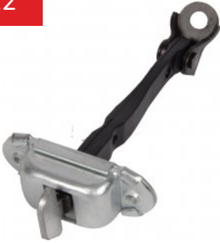
Oe Ref: 68630-0K091 DOOR CHECK STRAP HILUX VIII ( 2016- ) REAR RIGHT , REAR LEFT